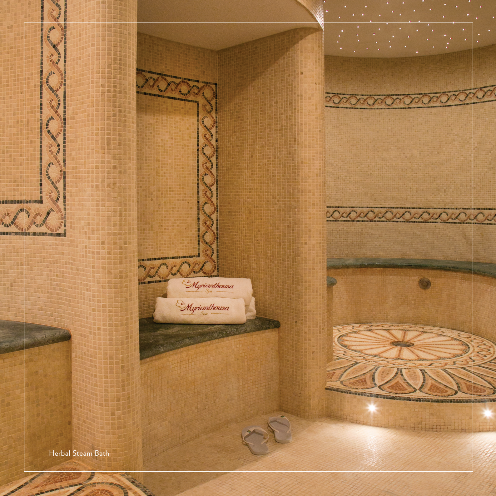
Herbal Steam Bath