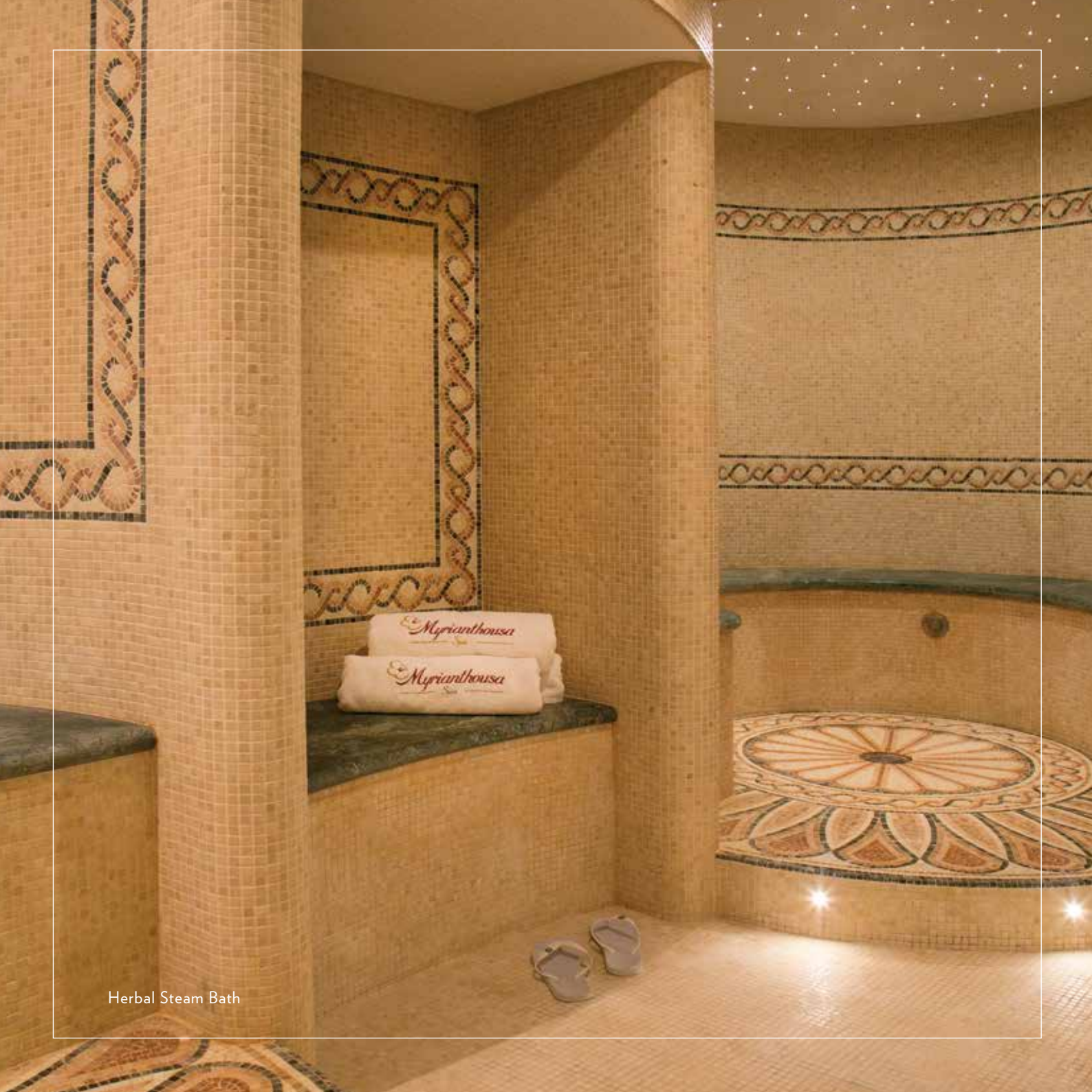
Herbal Steam Bath